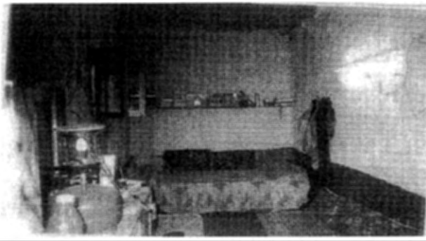
One of Shaykh Muqbil's old rooms