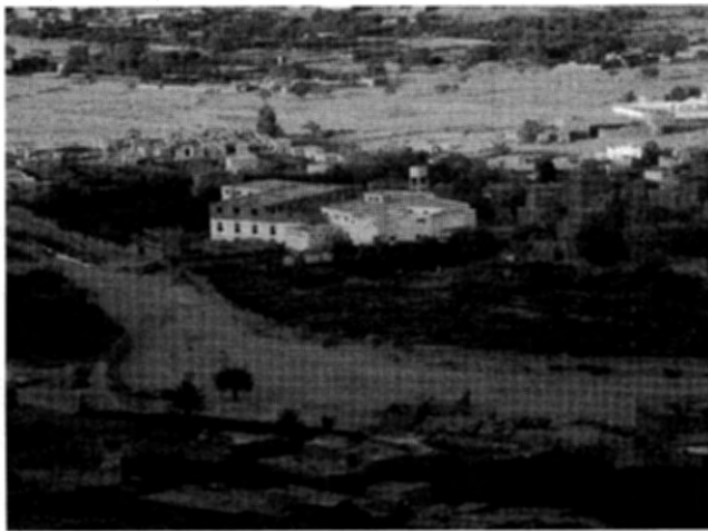
The Shaykh's masjid in Dammāj